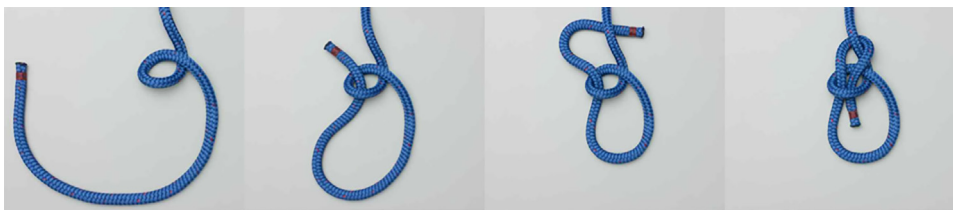
Trends in Cognitive Sciences

We argue that the emergence of a simple protolanguage in human evolutionary history greatly enhanced our analogy-building capability compared to that of non-human animals, catalysing the process of cumulative cultural evolution in our lineage (Figure 2, Key Figure). Although some analogical reasoning can be performed in the absence of language (Box 1), a form of protolanguage capable of simple verbal labels would have allowed early humans to link novel stimuli to familiar stimuli via analogical labels and to communicate this link to others (Figure 2). As highlighted in Figure 2, we are predominantly concerned with a stage of language evolution in which word labels are present, but abstract words such as 'similar/different' need not be. Although comparison terms are clearly important in analogy-making [47], our interest is in the more general property of all words to act as analogies [19]. Iconicity (i.e., a similarity between a